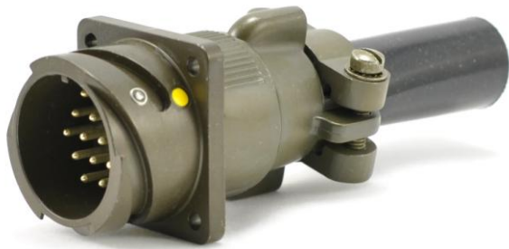
3100 Wall Mount Receptacle