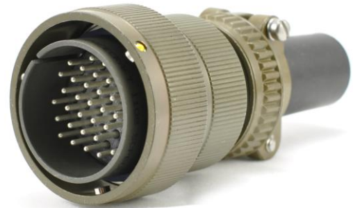
3106 Straight Plug