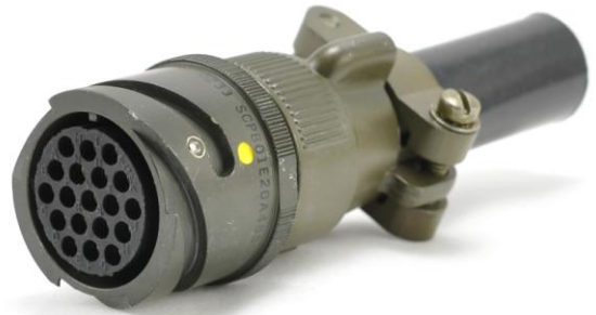
3101 In Line Receptacle