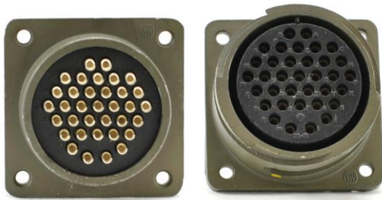
3102 Box Mount Receptacle